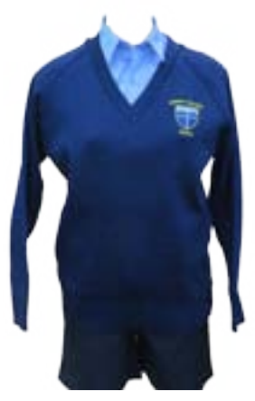
Summer shirt & shorts with jumper

Marian College introduced a new uniform for in 2019. All Year 7 and 8 students should be in the new uniform. Older students are welcome to wear the new uniform, noting that you are not permitted to mix items of the former uniform with new uniform.