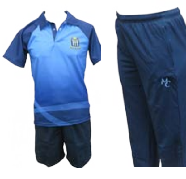
Sports Uniform for girls & boys