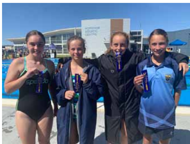
Under 13 Medley Relay Team