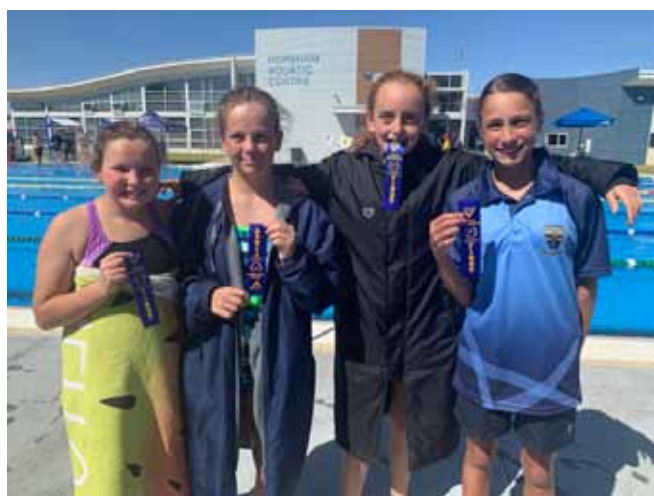
Under 13 Freestyle Relay Team