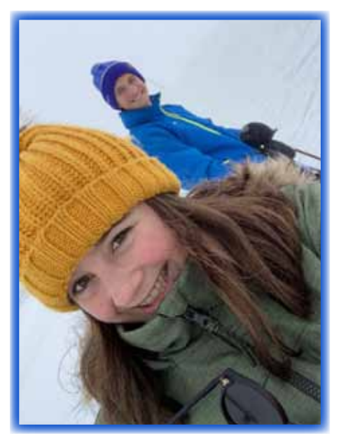
to achieve and teaching me the many life lessons that I will carry with me forever.

I wanted to say thank you to my teachers along this journey for making school bearable and for the support and advice I have been given and definitely more to come during this year. To my family who has been with me every step of the way reminding me to aim high for what I want