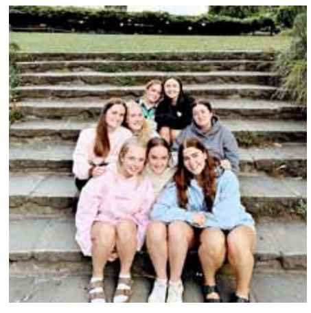
And then came the most daunting moment of my schooling experience, the big start at High School.

I have always been interested in the nursing and midwifery field and am hoping to pursue study in that area.