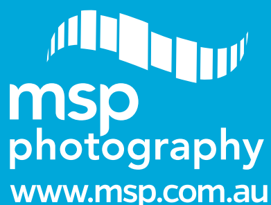
PHOTO DAY IS COMING ....