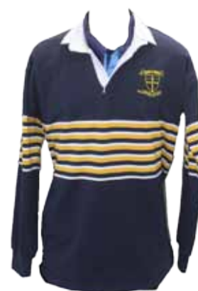
Sports Rugby Top