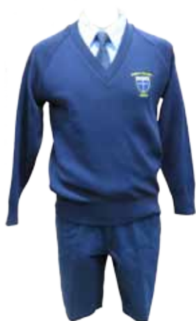
Summer Uniform with jumper