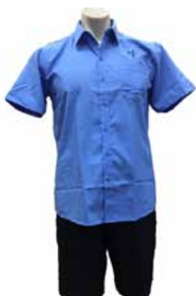
Summer shirt and shorts