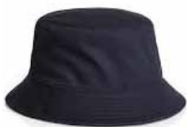
Navy Bucket hat

Please note Marian College accepts and appreciates donations of second hand uniform items