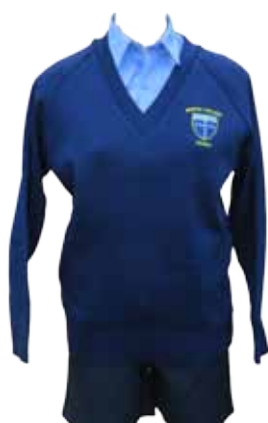
Summer shirt & shorts with jumper