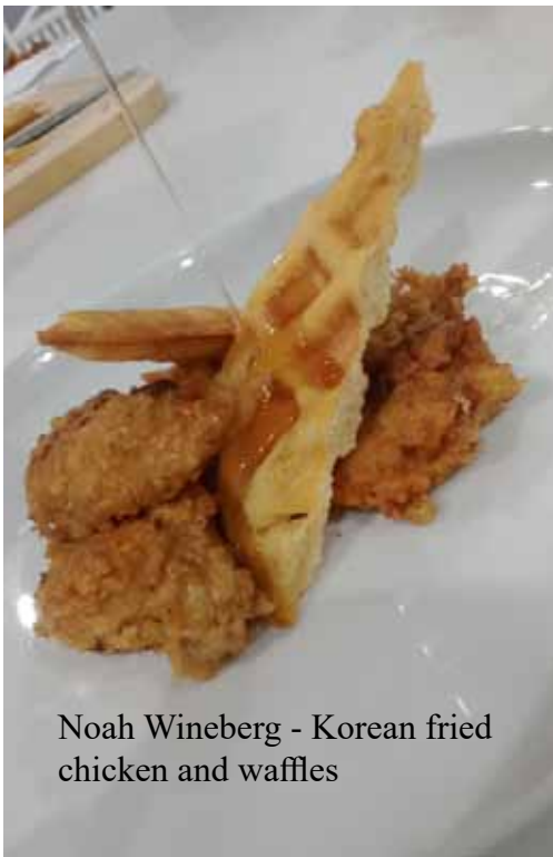
Noah Wineberg - Korean fried chicken and waffles