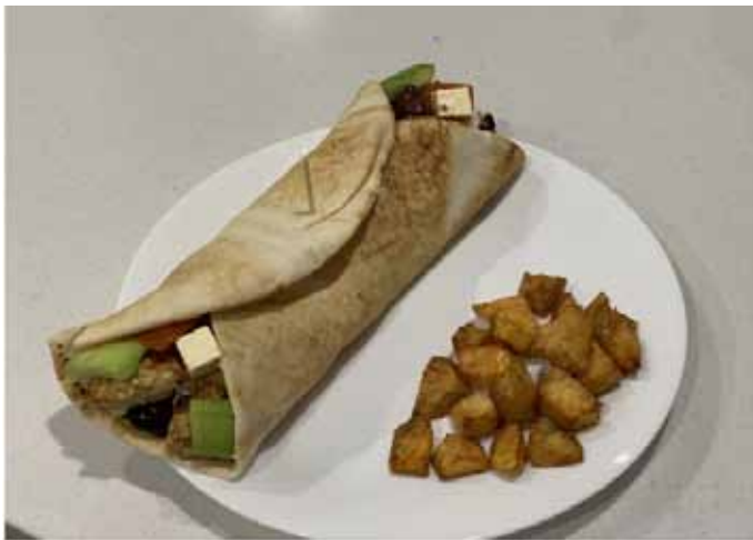
Greek Chicken Gyros - Lani Coburn