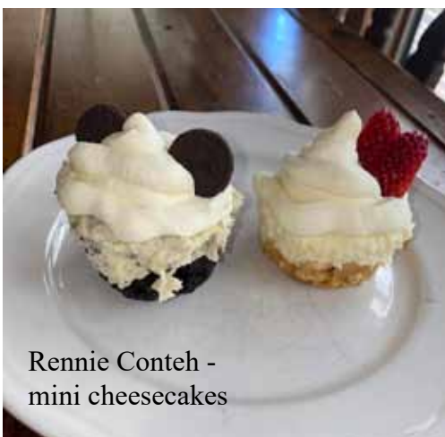
Rennie Conteh - mini cheesecakes