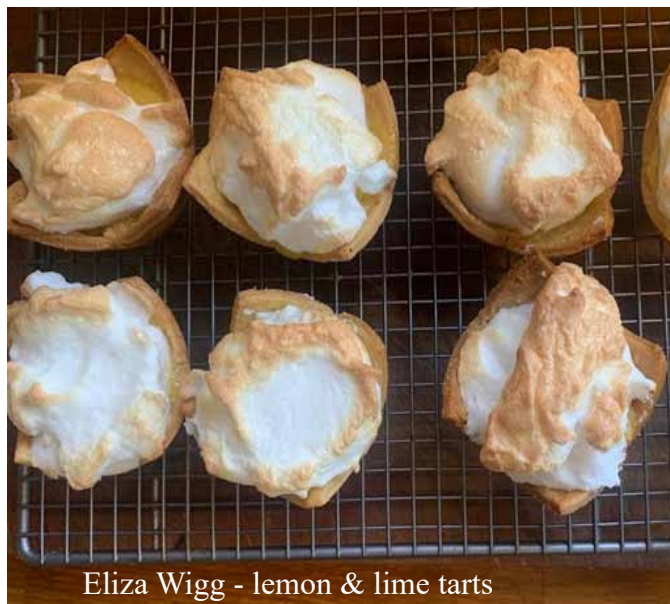
Eliza Wigg - lemon & lime tarts