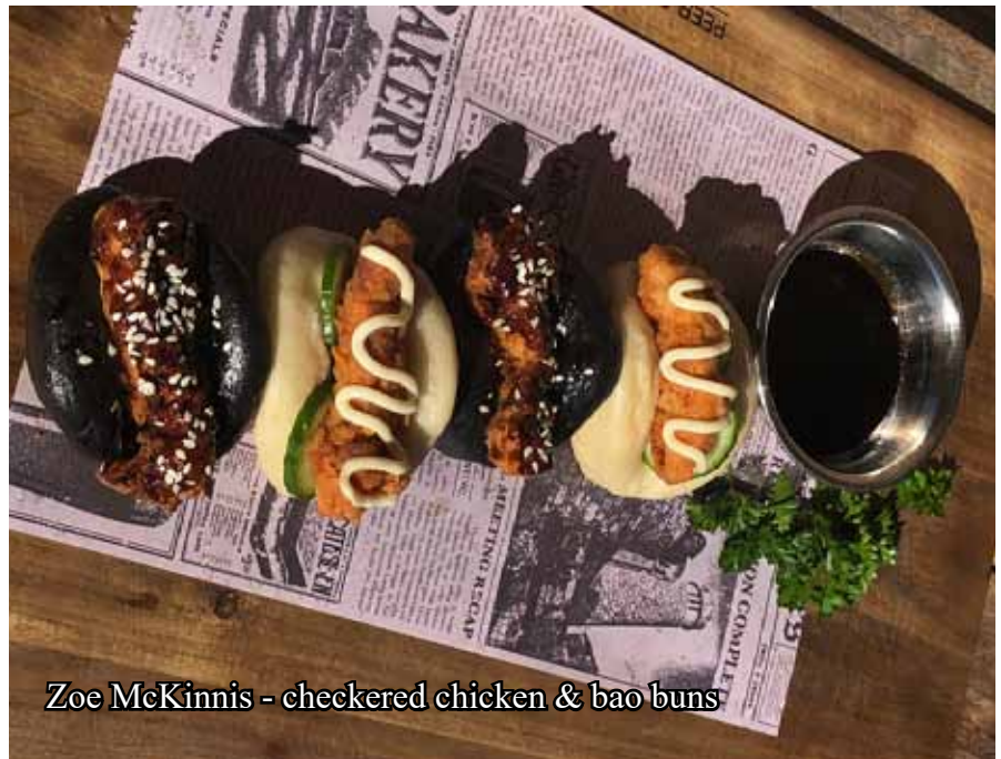
Zoe McKinnis - checkered chicken & bao buns