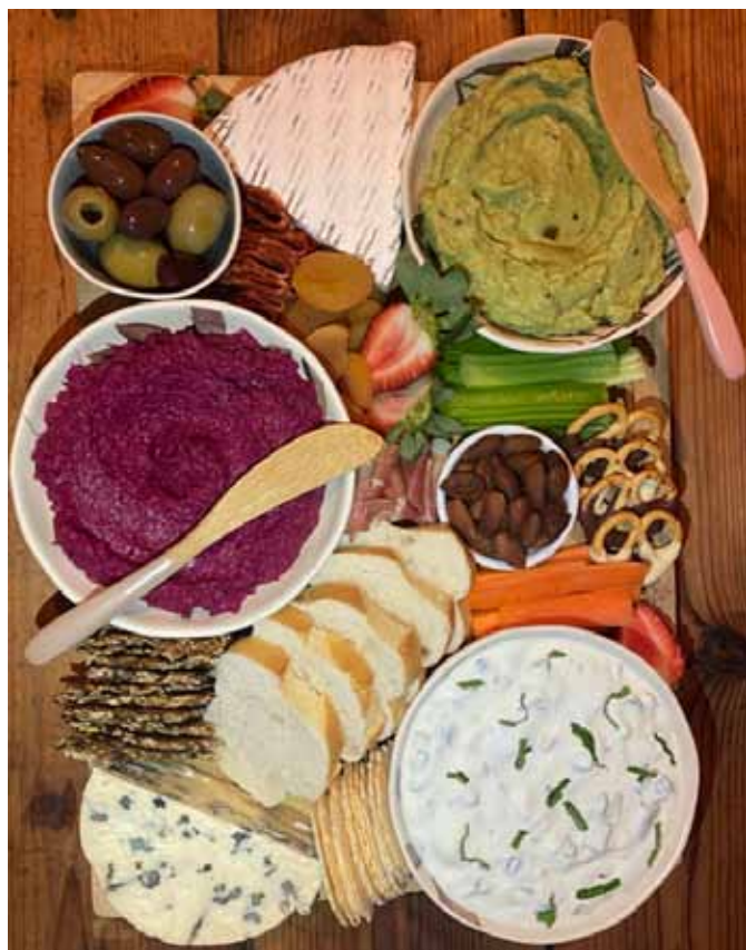
Louise Cooper - grazing board

The Year 11 Food Studies class are currently trying hard to complete their mini Food Diaries. The diaries contain productions that must include local, on trend and/or new ingredients, as well as research. Local ingredients that the students have been sourcing and working with are homegrown produce from their own gardens; Little Red Wagon and Greens eggs; Mount Zero olives and salt; Pyrenees Butchers cuts; Inglenook butter, milk, cream and greek yoghurt; Burrum Biodynamics oats/ spelt/legumes; Grampians Olive Co oil and honey; The Cottage Flower Farm; Great Western Granary loaves; Wilde's Lane and Mr Baker's homegrown garlic; Dad's oats - just to name a few. It has been wonderful to support local businesses and growers and this has also made the students much more aware of what is available around them in our wonderful region. It also tastes so much better!!!