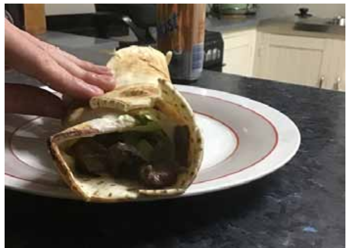
Greek Lamb Souvlaki - Vince Cusumano