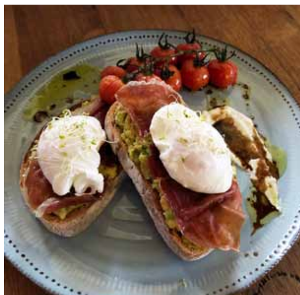
Zoe McKinnis - avocado toast with poached eggs & crispy prosciutto