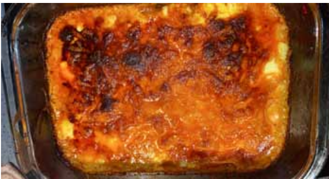
Greek Mousakka and Pezedes - Zoe Buckingham