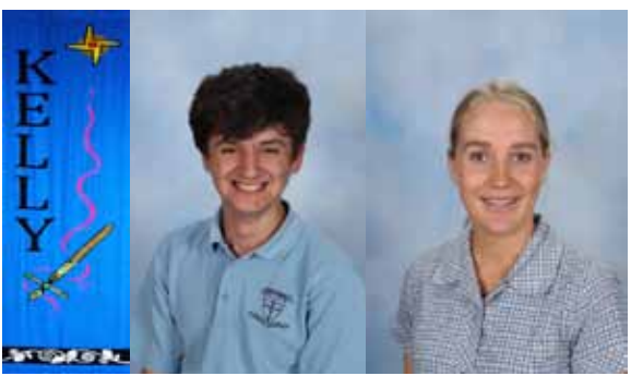
JAI TE HAU