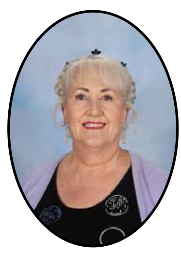
JUSTICE Tanya Waterson