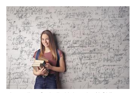
Australian Catholic University (ACU)

Discover ACU: ACU is hosting on campus interactive days for prospective students. You will be able to participate in interactive sessions tailored to your interests and speak to course advisers.