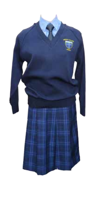
Winter skirt and jumper