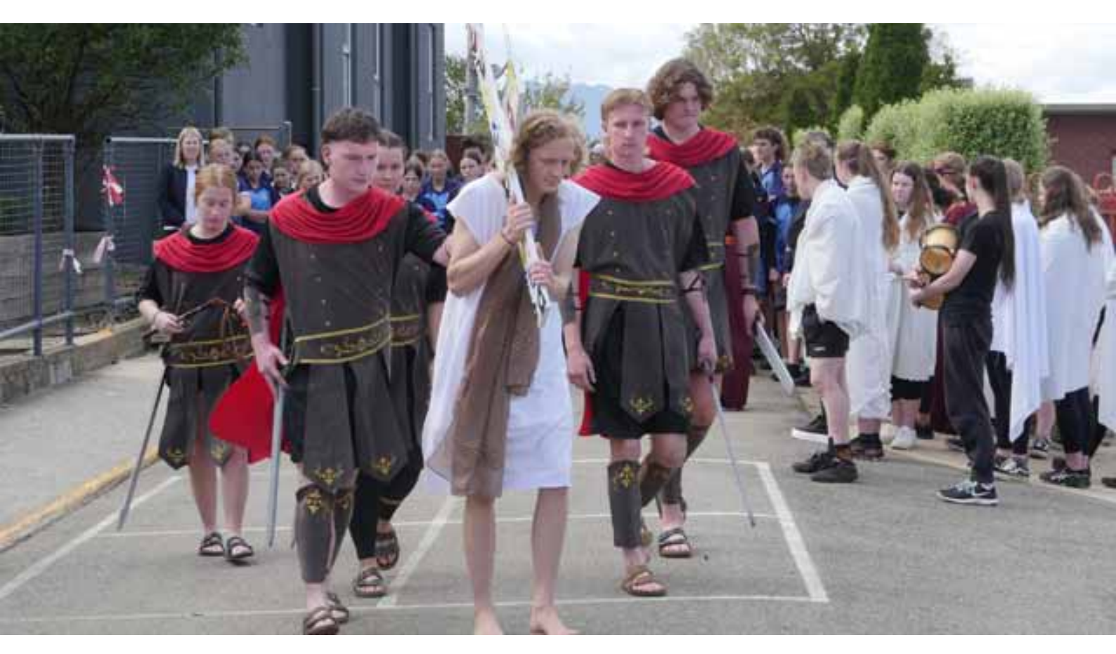
Stations of the Cross - pages 4 - 5