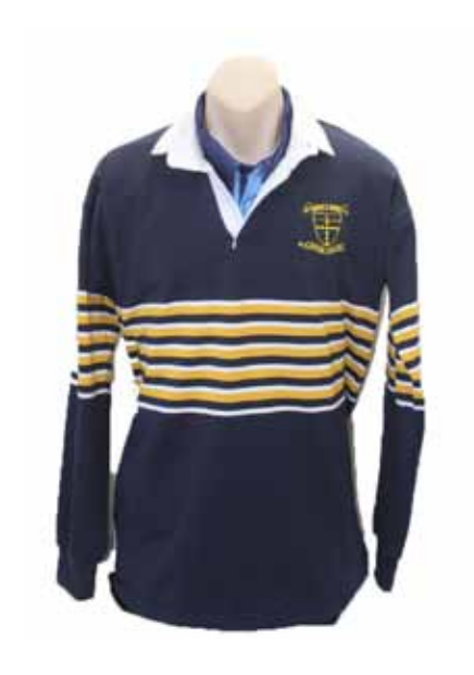
Sports Rugby Top