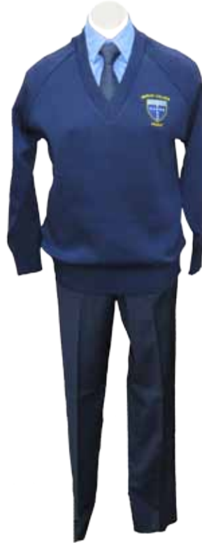
Winter slacks and jumper (tie is optional)