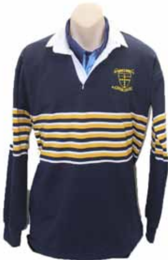
Sports Rugby Top