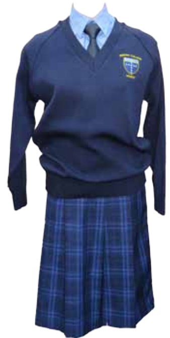
Winter skirt and jumper